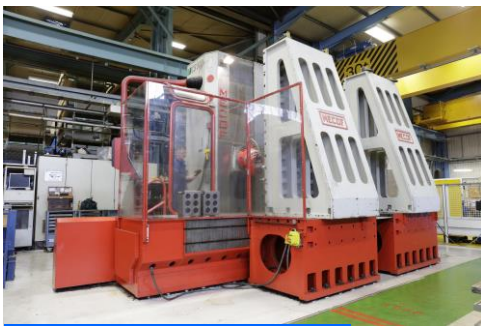
Large Scale CNC Machining – MECOF CS500