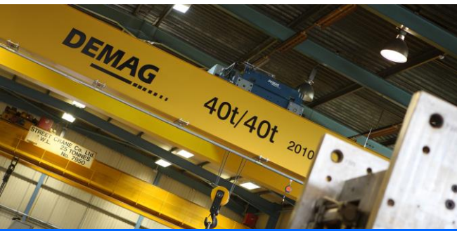
Full Tool Turning / Rotating Capability