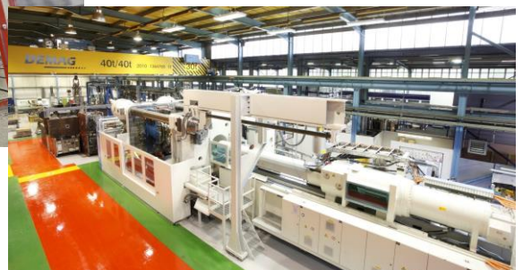
Injection moulding up to 3200T